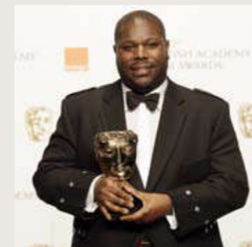
Steve McQueen, Hunger