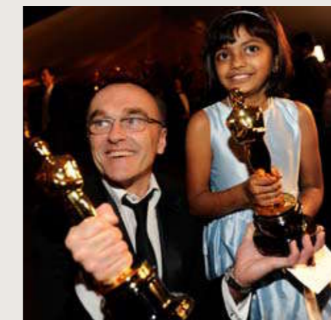
Danny Boyle and Rubina Ali, Slumdog Millionaire